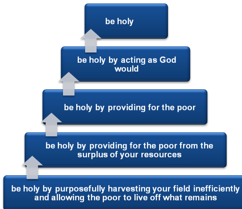
Figure 5.5 Levels of Abstraction

The principle can be constructed with varying degrees of abstraction from the original situation. 10 For example, at the closest level to the original situation, the principle which achieves the twin purpose could be constructed to be “be holy by purposefully harvesting your field inefficiently and allowing the poor to live off what remains.” This principle could be applied to an audience whose life setting is very similar to that of the Israelites in this passage, for example an audience in an agricultural village in a developing country. At one further level of abstraction, the principle could be “be holy by providing for the poor from the surplus of your resources”. Principles which are progressively more abstract (and therefore less concrete) are: “be holy by providing for the poor”, “be holy by acting as God would”, and finally “be holy”. These levels of abstraction are presented in figure 4.5 below.